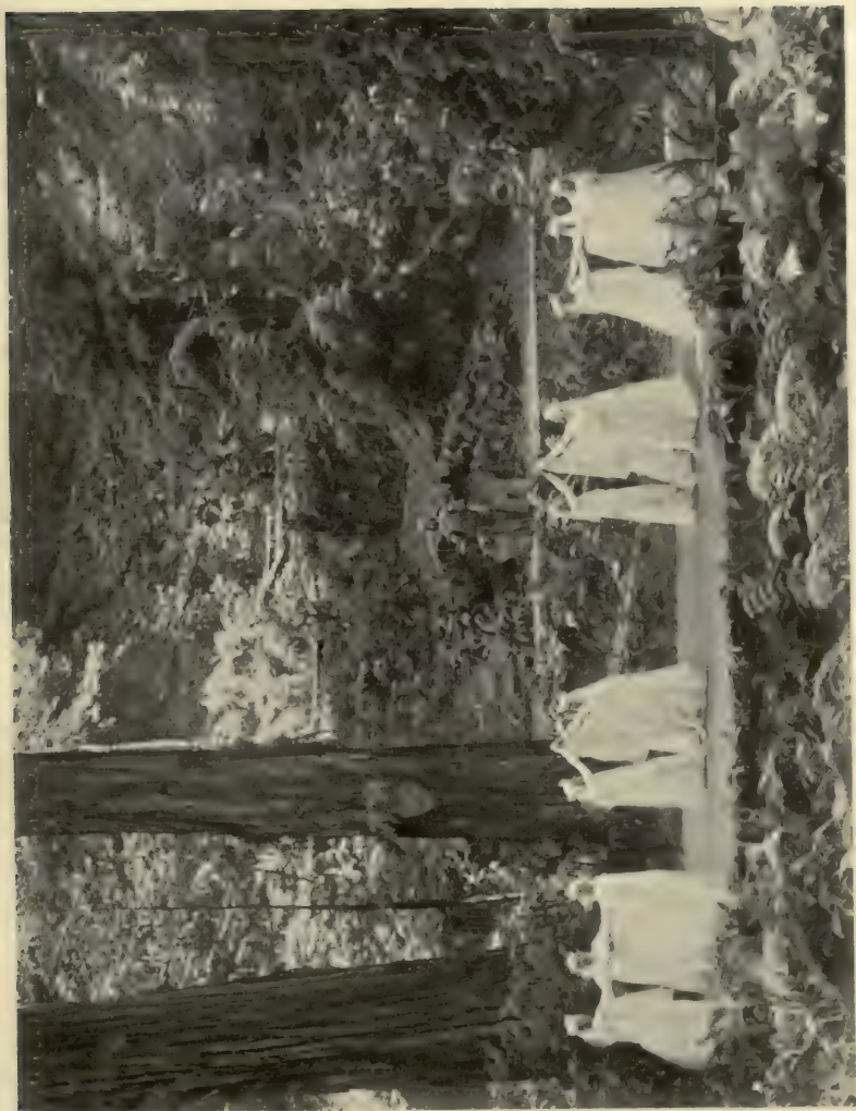
BOHEMIAN CLUB STAGE. CALIFORNIA